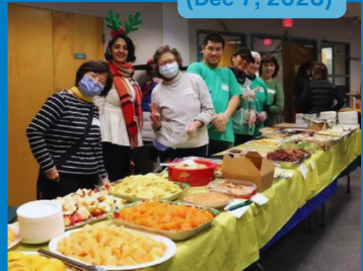
Christmas Potluck Party (Dec 7, 2023)