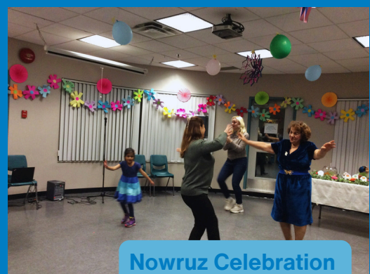
Nowruz Celebration (Mar 7, 2024)