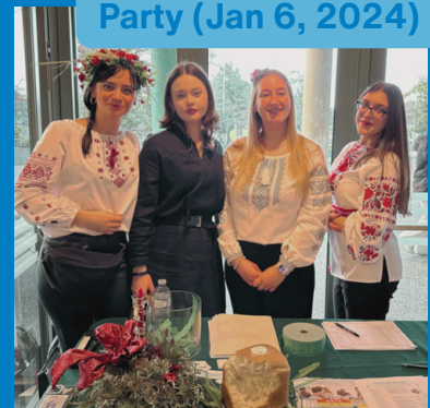
Ukrainian Christmas Party (Jan 6, 2024)