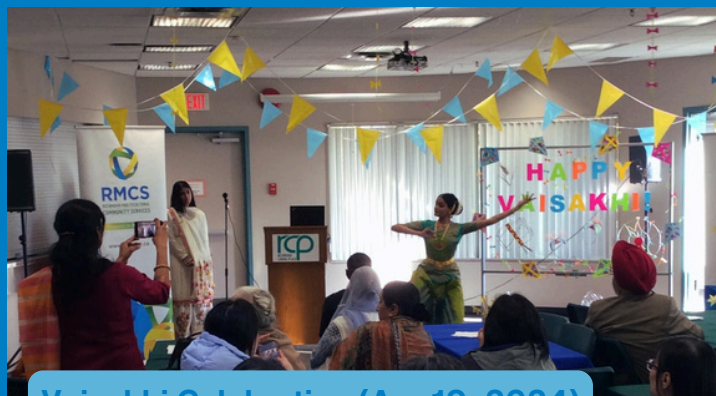
Vaisakhi Celebration (Apr 19, 2024)